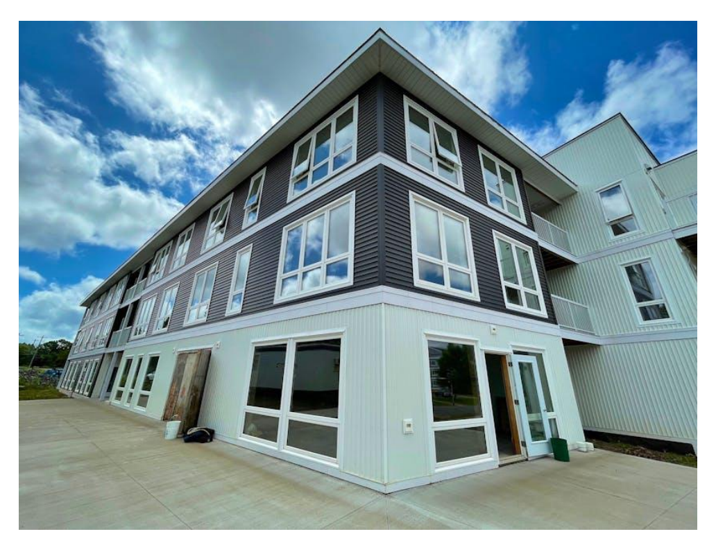
A new 104,000-square-foot apartment building in Wolfville will be ready by December and complete the Woodman's Grove development in the east end of town.

"It's a great example of how government can work with the private sector to make this happen," Blois said.